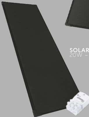
SOLARTHIN 20W - 12V