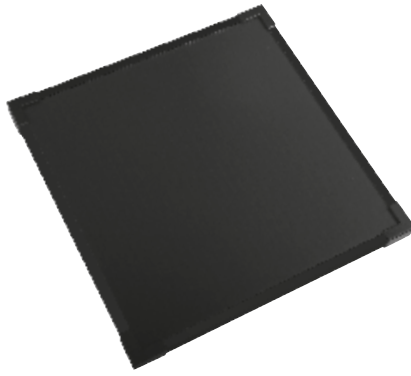
SOLARTHIN 7W - 12V