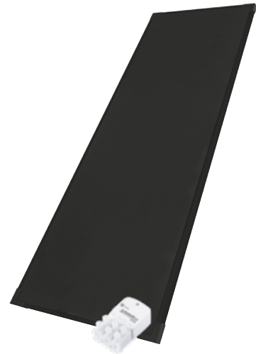
SOLARTHIN 20W - 12V