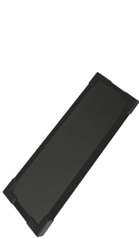
SOLARTHIN 2.5W - 12V