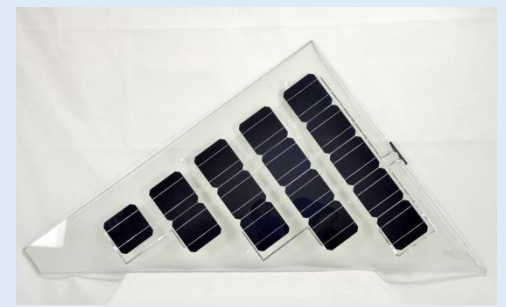
梯形 trapezoid BIPV