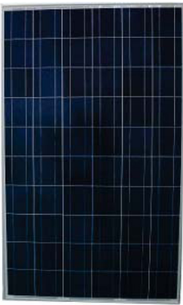
High Efficiency PV Modules