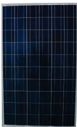
High Efficiency PV Modules