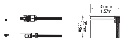
PV Connector Model - TT01, 1000V, 30A, IP67