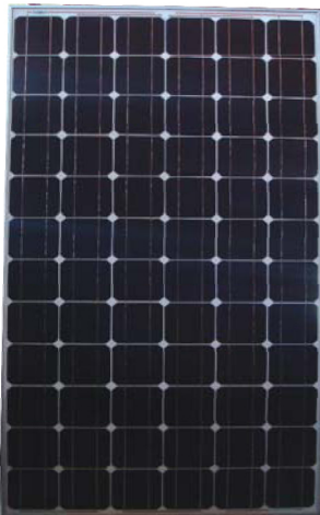
High Efficiency PV Modules