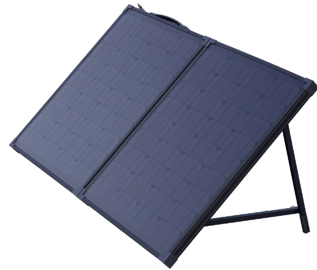
SUNPRO TWO FOLDS ALL BLACK SOLAT PANEL