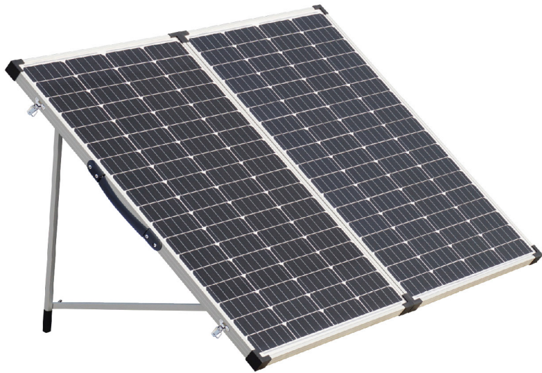
SUNPRO TWO FOLDS SOLAR PANEL