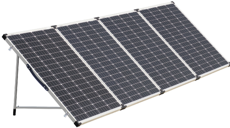
SUNPRO FOUR FOLDS SOLAR PANEL